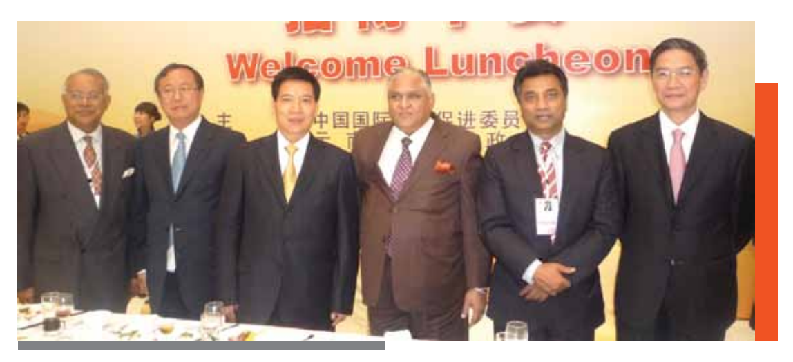
Welcome Luncheon in honour of delegates at 5th China South Asia Business Forum

The 5th China-South Asia Business Forum (CSABF), with a theme of "China-South Asia Cooperation under the background of global economic recovery", was held in Kunming, Yunan Province on June 5-7, 2010.