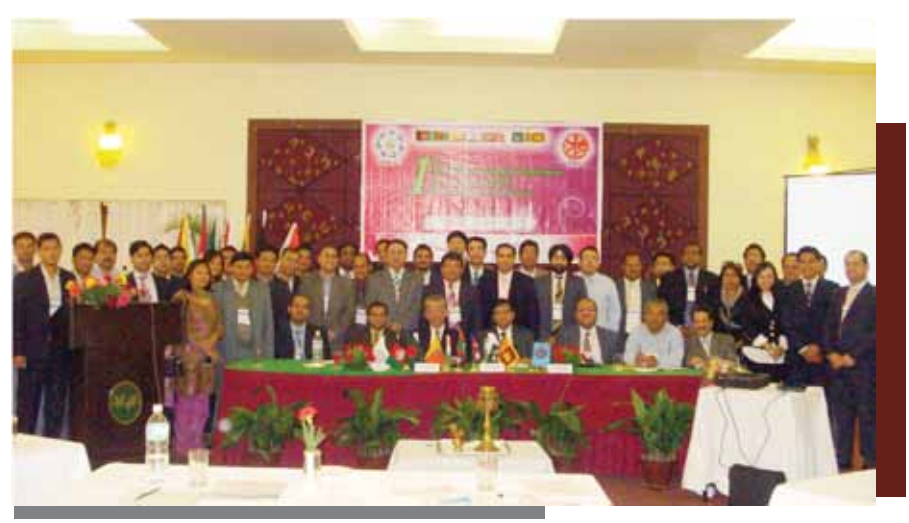
Group photo taken at SAARC CCI 1st Young Entrepreneurs Forum

The core objective of the forum was to bring together young business leaders so as to groom them to be the next generation of business leaders for South Asia and to identify their role in the formation of south Asian future business community.